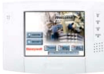
8132 Symphony Advanced User Interface

A blend of head-turning style and sophisticated technology, Honeywell's touchscreen keypads make it easier than ever to take advantage of your security system features and options, with graphics and menu-driven prompts guiding you and your employees every step of the way. Available in black and white (6270 TouchCenter) and color (8132 Symphony Advanced User Interface).