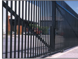
large gates up to 10,000 Lbs