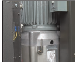
electrically released brake