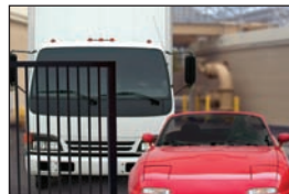
partial open user adjustable