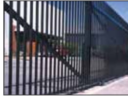
large gates up to 2000 Lbs