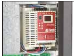
variable speed motor drive