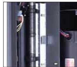
limit switches direct driven and easily adjustable