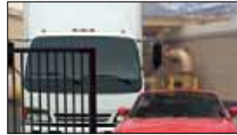
partial open open gate short distance for cars or open fully for trucks